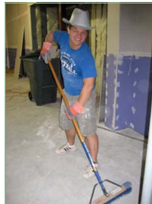
NAILS Worker, Concordia Jr./Sr. High School, Omaha

To learn more about the NAILS program and Laborers For Christ, visit www.lcef.org .