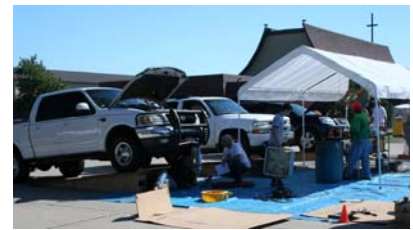
Car Care Day, Peace, Grand Island