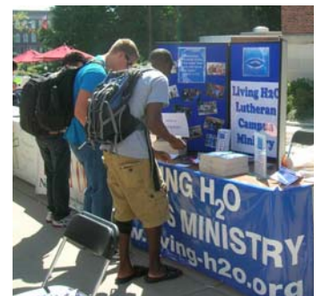
“Living H 2 O” Campus Ministry