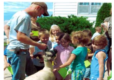
VBS, Zion, Leigh