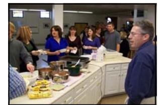
LINED UP FOR LUNCH

A huge thank-you to area Lutheran churches for cooking and serving the food. Pictured is a young men's leadership group from Christ Lutheran in Lincoln.