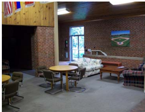
THE CURRENT COMMON AREA

Gifts given will allow the University Lutheran Chapel to continue reaching out to students, connecting them with God's love, each other, and the world they are a part of.