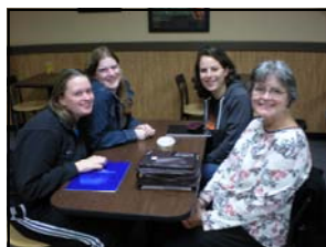
A GROUP OF STUDENTS WITH THEIR MESSIAH MISSIONARY

Each week we are given a new chapter of the Bible to study, and are encouraged to spend each day contemplating different aspects of the assigned reading. This has given rise to some compelling discussions about portions of the Bible that I had never given much attention to before. Most importantly, this study has kept me grounded in God's Word, and reinforced that when my life is chaotic and stressful, that is when I need His Word the most.