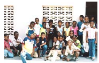
THE CHILDREN OF JAMAICA