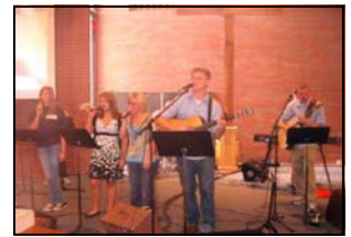
THE WORSHIP TEAM JOINS IN WORSHIP

Being a part of the Worship Team here at the Lutheran Chapel has brought me closer to God, has become a creative outlet, and a great opportunity for me to show leadership in the community; as well as meeting some outstanding people along the way!