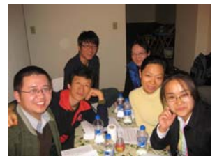
MEMBERS OF THE THURSDAY NIGHT BIBLE STUDY GROUP

Please pray for the students in this Bible study. May they all develop a true and living relationship with Jesus Christ!