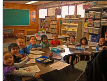
The preschoolers at work in the new school building