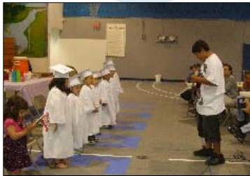
A sixth grade student leads the preschoolers in professing their faith in the Apostle's Creed

Jesus Our Savior Lutheran Preschool and Elementary School in Winnebago finished the first year of their elementary school and their 12th year of preschool this past spring. They held a worship and graduation service for eight preschool students on Wednesday, May 19, at the Blackhawk Community Center, with about 75 people in attendance.