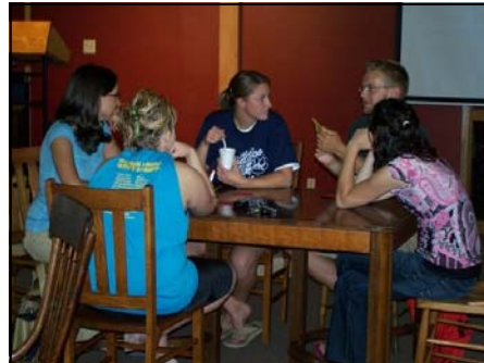
The Cup of Grace Christian coffee house is a ministry of Grace, Wayne, in partnership with the Nebraska District.

More information about the ministry at UNL is available on the Chapel website: www.lutheranchapel.org .