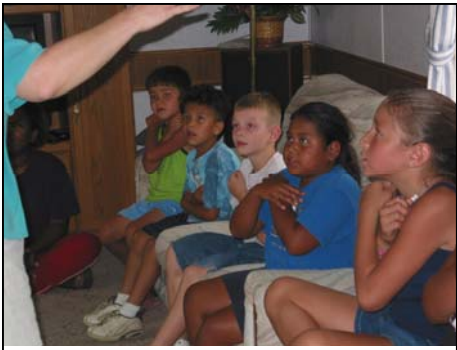
Kids Sing of God's Love