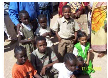
A group of children