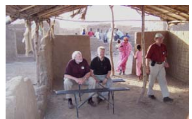
Inside a Sudanese refugee camp church