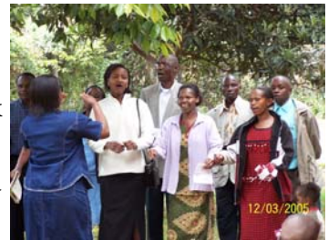
A choir welcomes the group

More information on this trip and the ministry in Sudan is available on the Nebraska District website, www.ndlcms.org . Additional photos from the trip are also available.