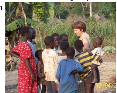
Visiting with the people