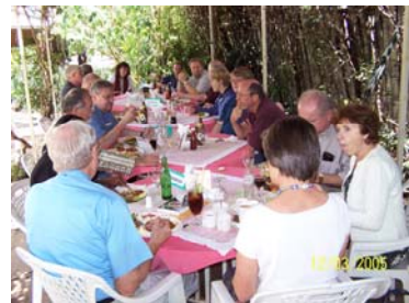
The LCMS group