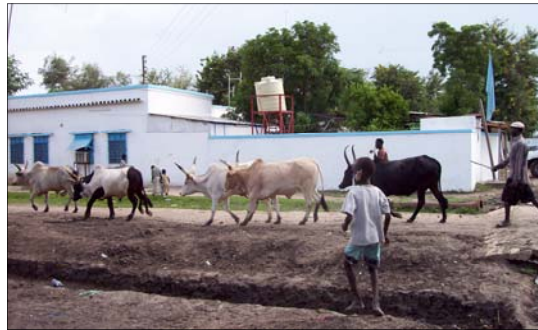
The cows of Malakal

Lutheran Church of Kenya, Lutheran Heritage Foundation, LCMS World Mission, Concordia Theological Seminary of Fort Wayne, Concordia Lutheran Ministries of Pittsburgh, and others also joined in this celebration service.